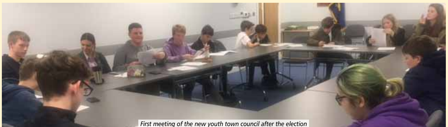
First meeting of the new youth town council after the election