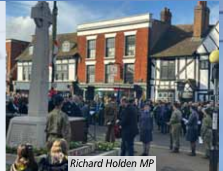
Richard Holden MP

The War Memorial itself is maintained by the Town Council, and we take great pride in keeping it looking its best throughout the year. It is regularly cleaned and cared for by our caretaker, while our contractor, Amethyst Horticulture, has recently refreshed the beds and pots with citrus-coloured plants – adding a welcome splash of brightness at this otherwise dull time of year.