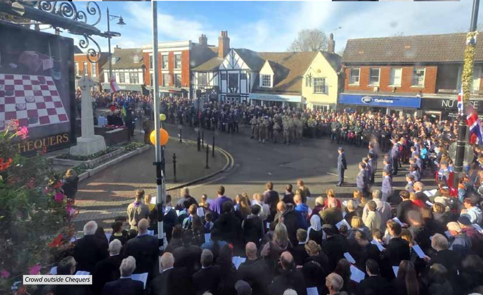
Crowd outside Chequers