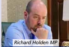
Richard Holden MP